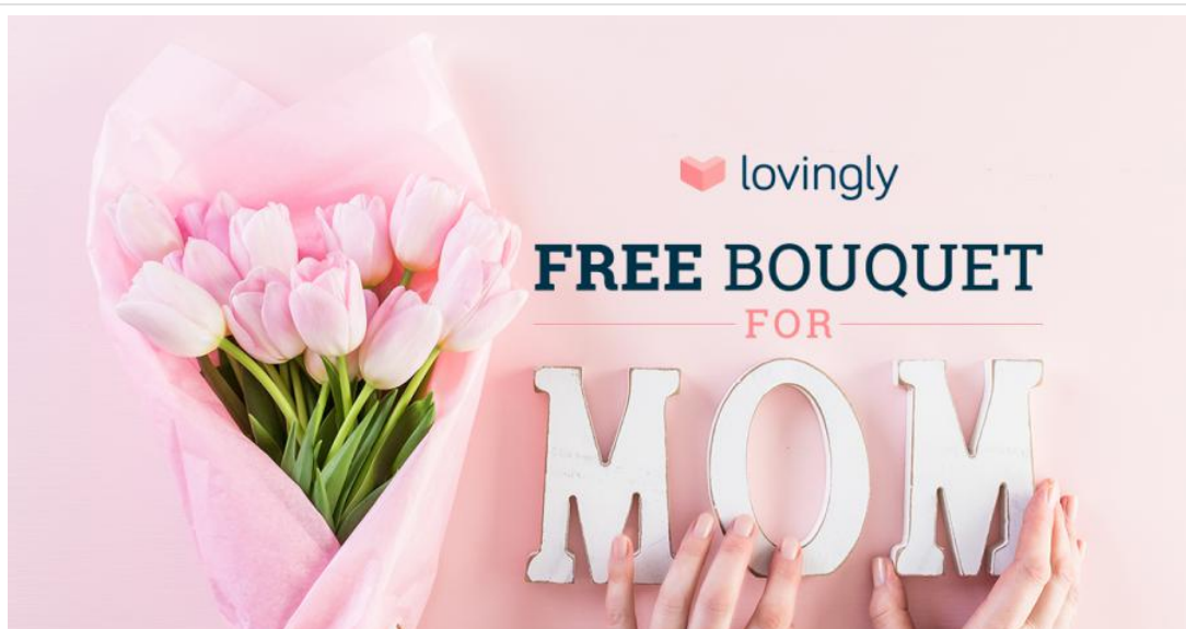
( https://www.einnews.com/image/large/64138/lovingly-free-bouquet-for-mom.jpeg )

If you have a story about a uniquely important mom in your life, Lovingly wants to hear about it.