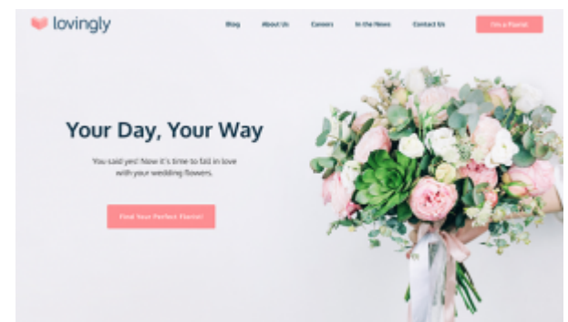
( https://www.einnews.com/image/large/62330/lovingly-com-homepage.png )