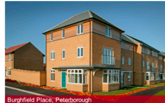
Burghfield Place, Peterborough

Home About Us Buying Your New Home Media Centre Customer Service Second Hand Homes